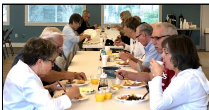
Yum—good eats enjoyed by all...