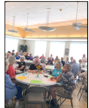
Welcoming the "newbies"...