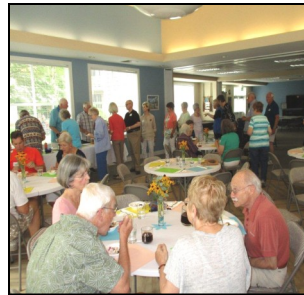
Always, the long line...