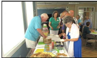
"Are you being served?"